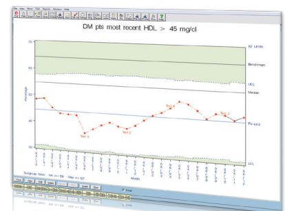
3. Searchable patient data is automatically generated to help quickly produce meaningful clinical care reporting.